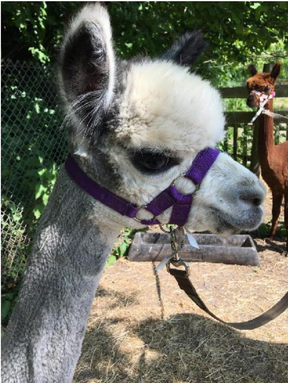
Hensting Santolina Head